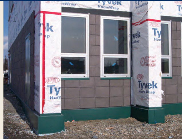
Battalion Headquarters Building FORT WAINWRIGHT Fairbanks, Alaska

Castia Stone was selected to clad the Battalion Headquarters Building at Fort Wainwright in Fairbanks, Alaska. From a cold weather test station to one of the Army's premier training areas, Fort Wainwright has come a long way. As a site once used for testing cold weather clothing and equipment in the bitter cold winters, this Fort required something that would stand up to the elements. Castia Stone has many features that make it optimal for installing in harsh climates like Fairbanks, Alaska as well as all other climatic areas of the world.